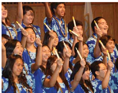
Performance at Arrow Heights Baptist Church in Broken Arrow, OK