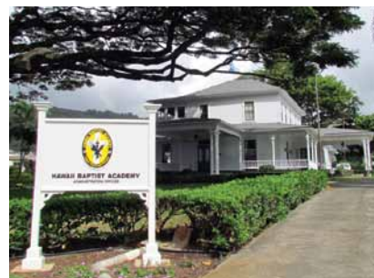
HBA Administration Offices at 420 Wyllie Street in Nuuanu