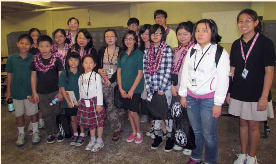
Visiting students from the Wuhan David Perry English Training Center in China with HBA student hosts

Hawaii Baptist Academy's reputation for its high academic standards and Christian emphasis extends beyond the shores of Hawaii. In January, HBA welcomed 10 students from the Wuhan David Perry English Training Center in China for a week-long opportunity to participate in a meaningful exchange of cultures between students.