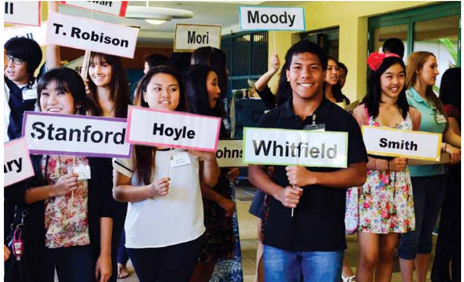
Students from the President's Aloha Council (PAC) anticipate the arrival of MAC guests

The Mainland Advisory Council (MAC) held its 36th annual meeting in Honolulu in February. During their stay, the MAC and their families visited the school's campuses, and met with students,