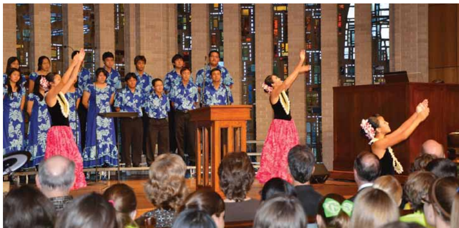
Performance at Tallwood Baptist Church in Houston, TX