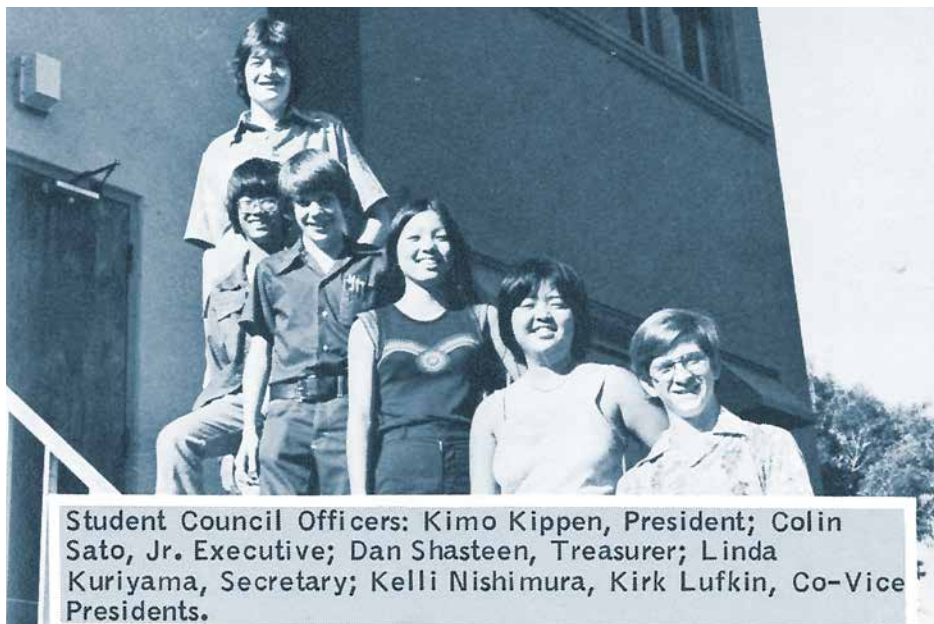
Class of 1977 Yearbook