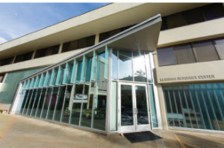
The renovated Learning Resource Center opens in October 2013.

The new Arts and Science Building is completed.