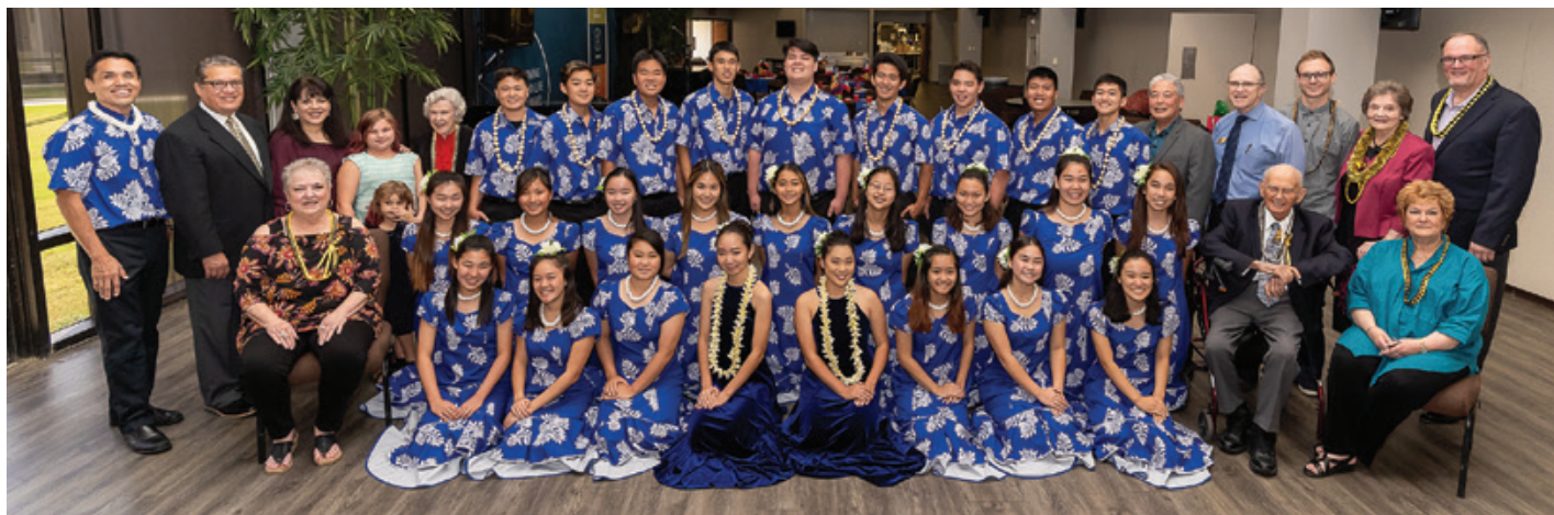
The Soldiers of Light choir poses with MAC members at First Baptist Richardson.