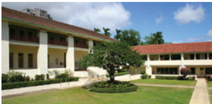
HBA purchases the Sacred Hearts Convent School in 1987.