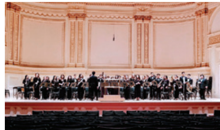
HBA's Wind Ensemble performs at Carnegie Hall at the Sounds of Spring International Music Festival and at the First Baptist Church of Alexandria, Virginia.