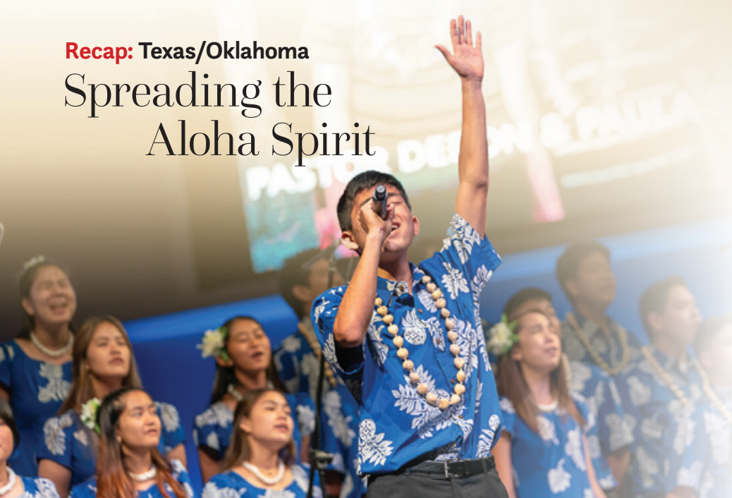
The Soldiers of Light choir performs at First Baptist Richardson in Dallas, Texas.

THE SOLDIERS OF LIGHT (SOL) traveled across Houston, Dallas and Tulsa for 13 days in October to spread the aloha spirit through song, hula and testimony. They visited many of our faithful Mainland Advisory Council (MAC) members at their churches and care homes.