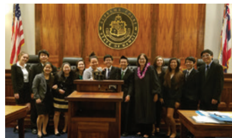
HBA's Mock Trial team wins their first state championship.